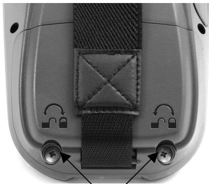
Battery Door Screws

Turn the WPA206 over and place it on a solid flat surface. At the bottom of the back of the unit there are two large screws below the lock and unlock images.